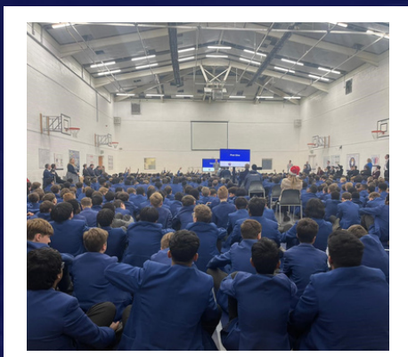
HOUSE AWARDS AND KENNEDY CUP