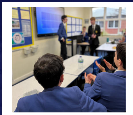
FISHER SCHOLAR LECTURE