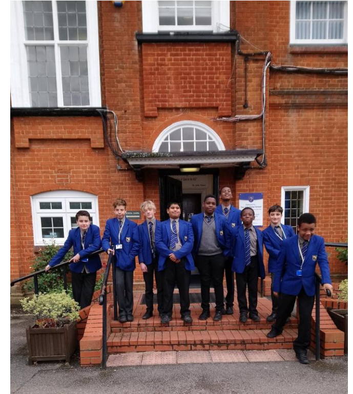
This is outside main reception.