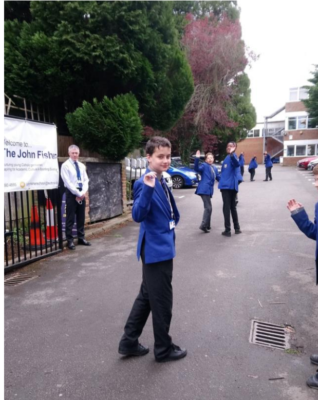
This is the back gate, where the current Year 7 students enter the school site.