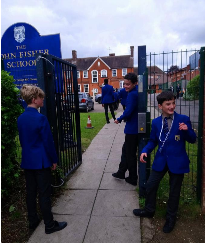
This is the pedestrian gate at the front of school.