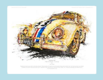
Title "Herbie H2" Artist: Ian Cook Date: 1913. Materials: Paint and radio controlled car