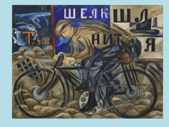
Title: Cyclist. Artist: Natalia Goncharova. Date: 1913. Oil on canvas.

For your own version , you should look out for a style of car, bike or bicycle that really interests you, it may be a sports, concept car or Formula 1 racing car.