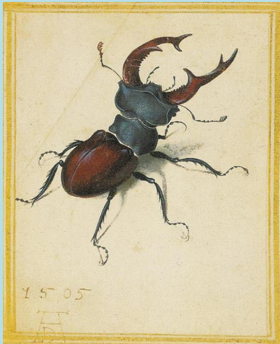
Dürer Stag Beetle Watercolour 1505