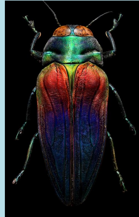
Levon Biss Untitled Photography 2020