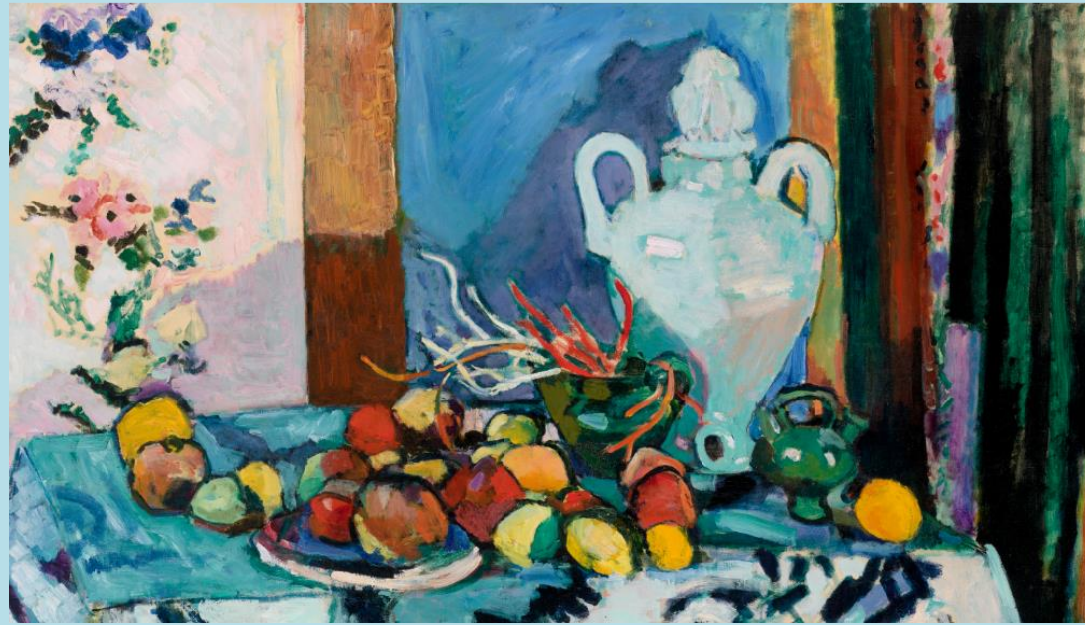
Blue Still Life (Nature morte bleue) Henri Matisse 1907