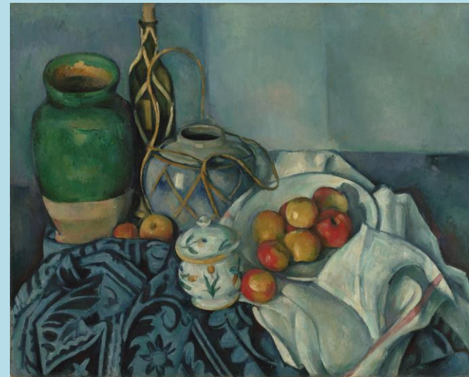
Still Life with Apples