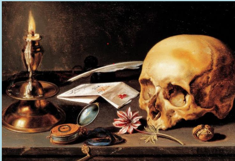
Vanitas Still Life