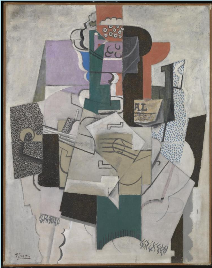
Bowl of Fruit, Violin and Bottle Pablo Picasso 1914