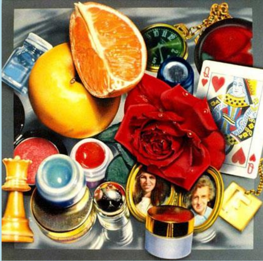
Queen Audrey Flack 1975-76 Oil paint on canvas